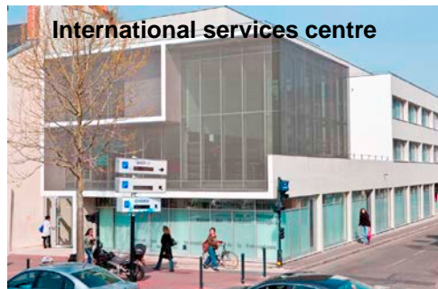
International services centre