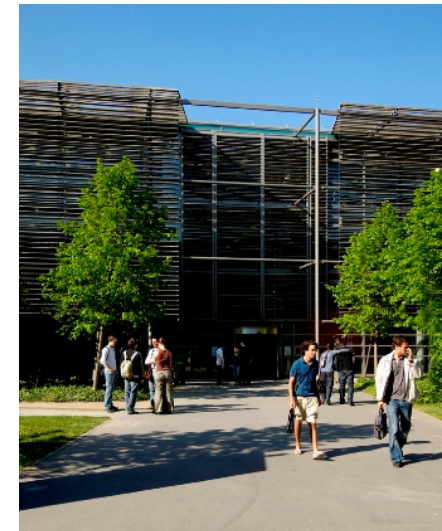
University Library - Economics and Law