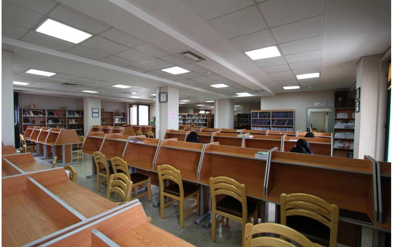
Picture of School's Library