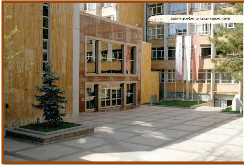
Hacettepe University Culture Center Sihhiye Campus, Ankara - TURKEY