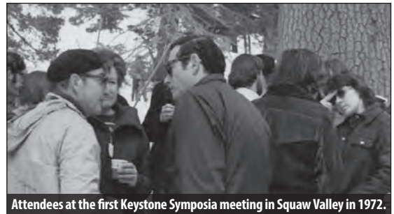
Attendees at the first Keystone Symposia meeting in Squaw Valley in 1972.