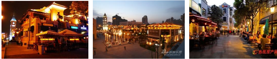
The scenery of Italian Style Town at night