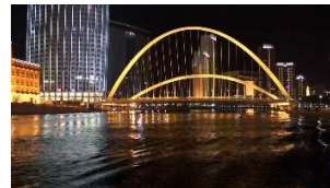
The scenery of Haihe River at night