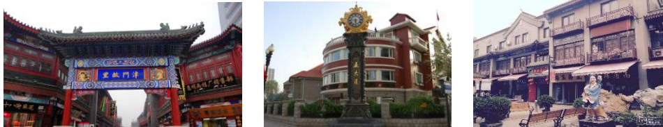
Ancient Cultural Street

We will arrange a one-day tour in Tianjin for you. You will visit several scenic spots which are very attractive and famous even in China and we hope you can enjoy this tour.